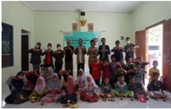
Pict 1. Learning English Program at one Islamic Boarding School, Muara Angke

Experienced a positive impact, the Chief of Sunda Kelapa Police Sector asked to continue this program but move to an orphanage in that area. This orphanage is a home for those who need it. It was built by a young entrepreneur and has received support from stakeholders and donors, can accommodate 25 to 30 orphans. Not only that, it also has schoolroom facilities that can accommodate 100 to 150 students. Apart from that, there were also lots of small support and good responses from the orphanage owners, managers, and even the children in the orphanage.