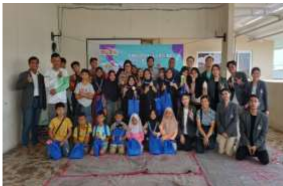
Pict 2. Learning English Program at one Orphanage, Muara Angke

Experienced a positive impact, the Chief of Sunda Kelapa Police Sector asked to continue this program but move to an orphanage in that area. This orphanage is a home for those who need it. It was built by a young entrepreneur and has received support from stakeholders and donors, can accommodate 25 to 30 orphans. Not only that, it also has schoolroom facilities that can accommodate 100 to 150 students. Apart from that, there were also lots of small support and good responses from the orphanage owners, managers, and even the children in the orphanage.