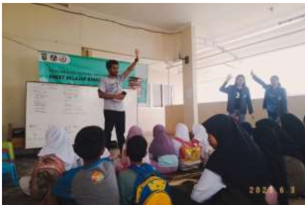
Pict 5. One of the lecturers leads and supervises the learning session

This English learning program was conducted every Saturday for 5 months, February-July 2023 at the Orphanage. Participants of this tutorial consist of 20-50 students that live in Tanjung Priok, and 10 students of English Language Education and Primary School Education ranging from second to sixth semester work as tutors. On the other side, the lecturers guide and provide direction for planning, implementing activities, and assessments.