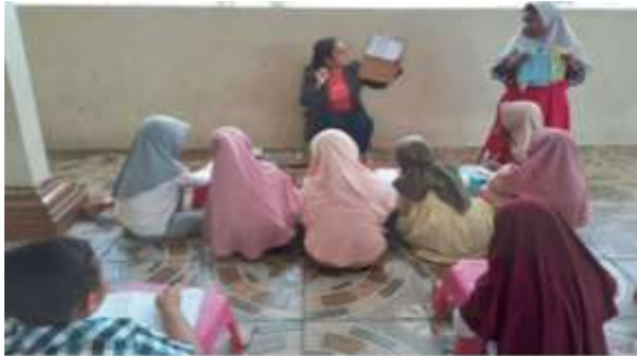
Pict 3. Teaching and learning process by the tutors.

Through this learning, students are able to experience improvements in their English skills to produce the best practices in society and even globally through inclusive learning.